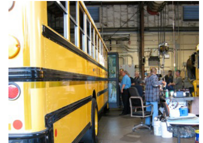
Central prepares a bus for the visit