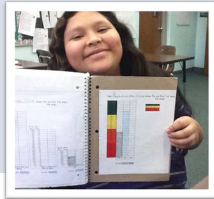
Student – LES