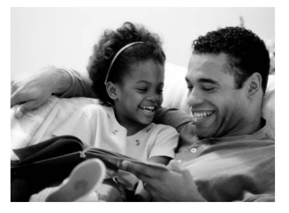
Family and community involvement make a significant difference in a child's success.

Families and community members are encouraged to volunteer in our schools. There are many areas in which volunteers assist: assisting teachers, working with students, supervising students, and helping with school activities to name just a few. To register to be a volunteer at a school go to www.pasco.k12.fl.us and click on the Volunteer Application.